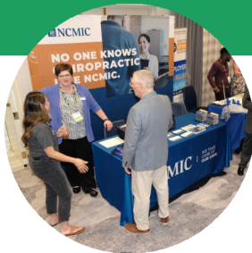
EXHIBIT OR SPONSOR

Exhibit or Sponsor at the ABCA Convention and position your team to: